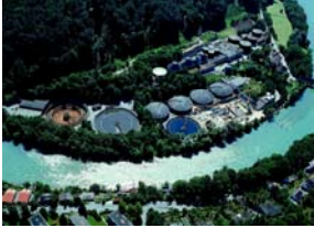
Figure 1: WWTP Bern, Switzerland

Sewer systems and central wastewater treatment have a variety of advantages, however, there are some deficiencies: