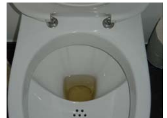
Figure 2: The recycled wastewater shows a yellowish colour

Colour removal can be obtained by several techniques: ozonation, adsorption to activated carbon or ferric hydroxide or chlorination. Ozonation and adsorption seem to be the most economic ones.